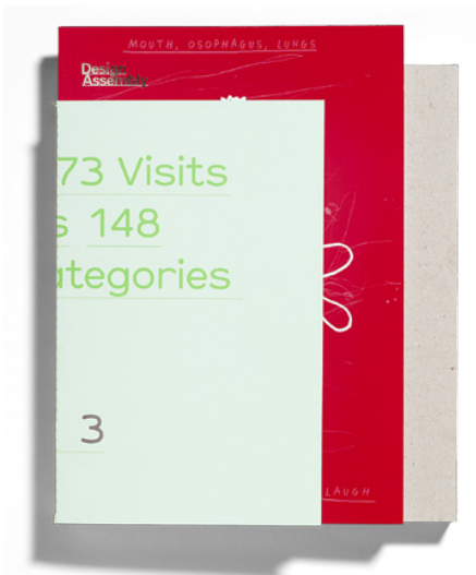
3, designed by Matt Judge